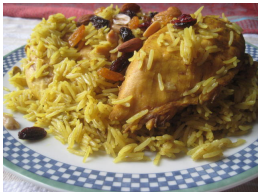
rice with chicken (or sheep, beef, fish)